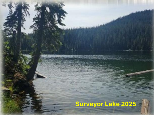
Surveyor Lake 2025