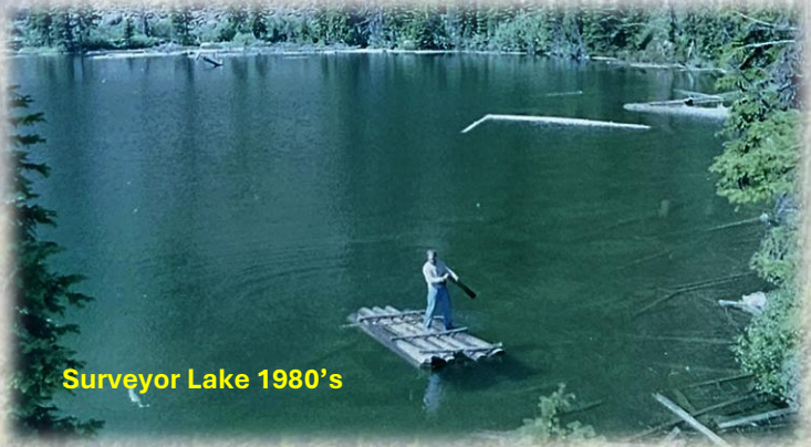
Surveyor Lake 1980's

The shoreline is difficult to get around because of the brush and swampy areas. If a person was serious about fishing, then they should bring in a small raft or float tube. The lake gets a lot of traffic due to its short distance from the road. Most people gravitate over to the rock outcrop to spend the day in the sun and fish. I have seen some old maps from the 30's and 40's that do not have the lake on a map.