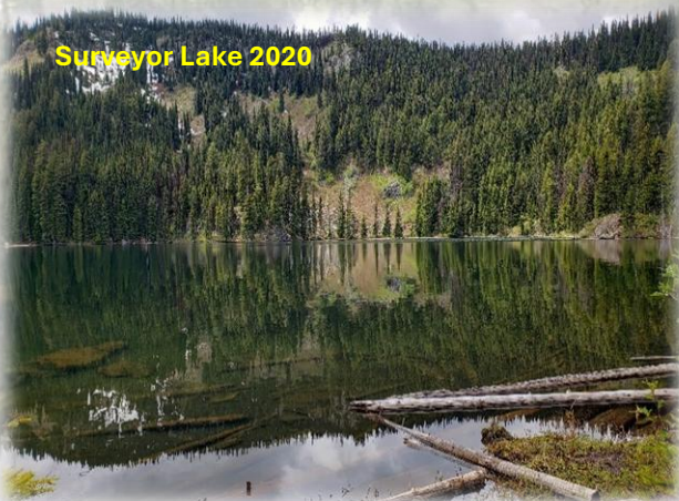
Surveyor Lake 2020

The first time I went into the lake back in the mid 1970's I could see schools of fish swim by and not even look at the lure passing just in front of them. I have done well fishing with flies when the fish are feeding under the logs close to shore.