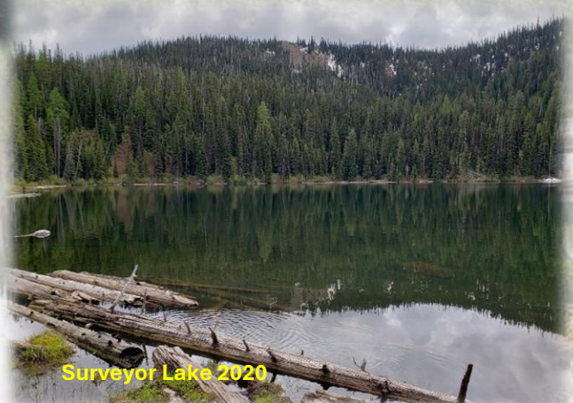
Surveyor Lake 2020