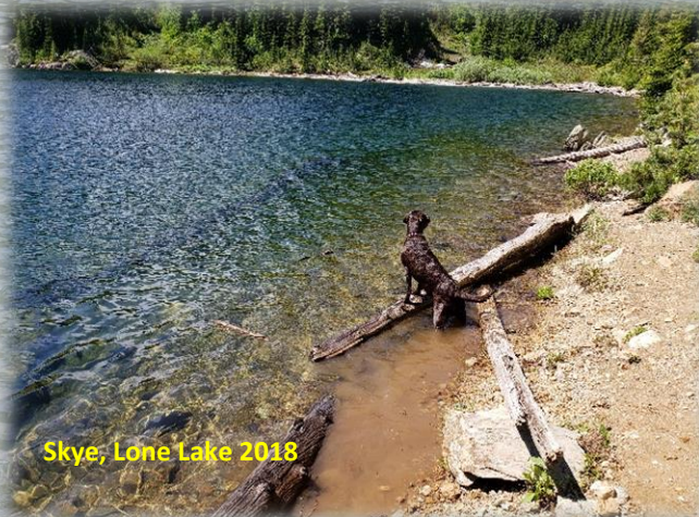
Skye, Lone Lake 2018

From there the trail continues to climb and switchbacks up the hillside before lining out to the lake. The lake is about 1.75 miles from the upper trailhead. There is some water outside of the waterfall from small seeps but can be limited during the latter part of the summer and early fall.