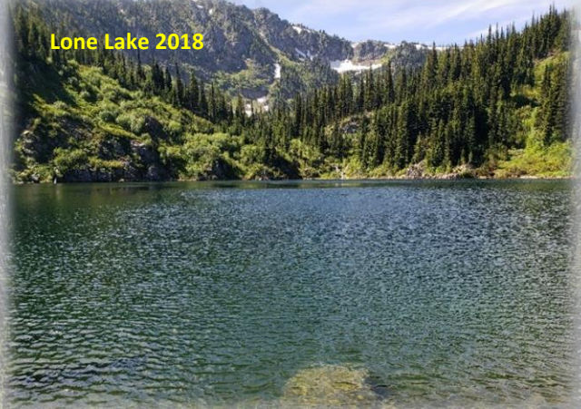
Lone Lake 2018

2023. There are a couple campsites around the outlet area, and I believe one across the lake near the rock outcropping. On the day the dog and I went we saw 2 other parties. A couple came by while I was fishing, and I saw another couple down by the trailhead on my way out. This lake does not get the same traffic as Stevens Lakes. This could be a good alternative if Stevens Lakes appears to be crowded, which on many weekends it tends to be.