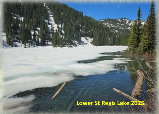
Lower St Regis Lake 2025