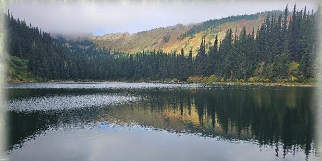
Lower St Regis Lake 2024

The trail (#267) starts at the parking area, there is also a small place to camp, and goes about a hundred yards where you angle down to the right and cross the creek coming out of the St. Regis basin. This early part of the trail is accessed by SxS and bikes until the creek crossing, then heads up toward the state line. Trail #267 crosses the creek then moderately meanders across the hillside for