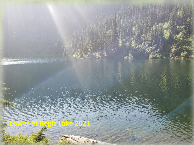
Lower St Regis Lake 2021