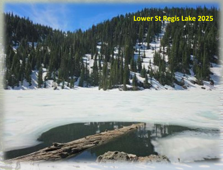
Lower St Regis Lake 2025