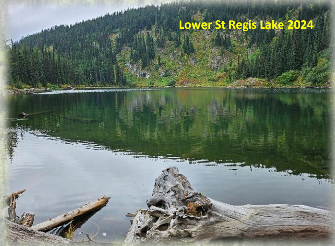
Lower St Regis Lake 2024