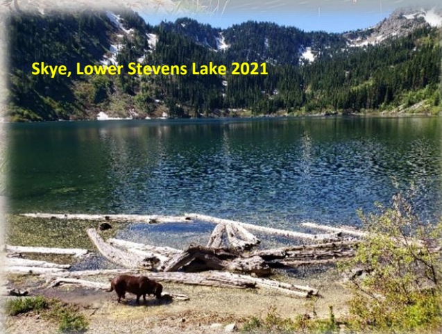
Skye, Lower Stevens Lake 2021

The trail (#165) starts up an old road for a 1/4 mile, stay straight at the old tailings landing. This portion of the trail is accessible for motorcycles and side by side but turns left back toward lookout at the tailings landing.