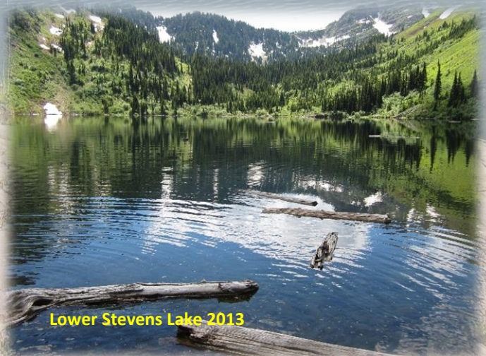
Lower Stevens Lake 2013

their lap dogs as they were barking at everything and were not well behaved. If a person was looking for some solitude and quiet, that was probably