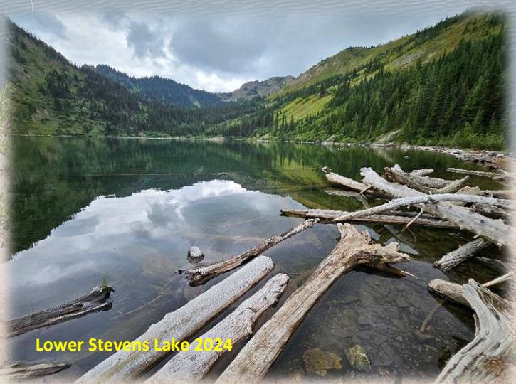
Lower Stevens Lake 2024