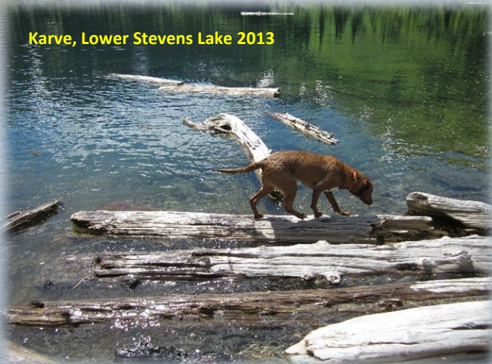
Karve, Lower Stevens Lake 2013