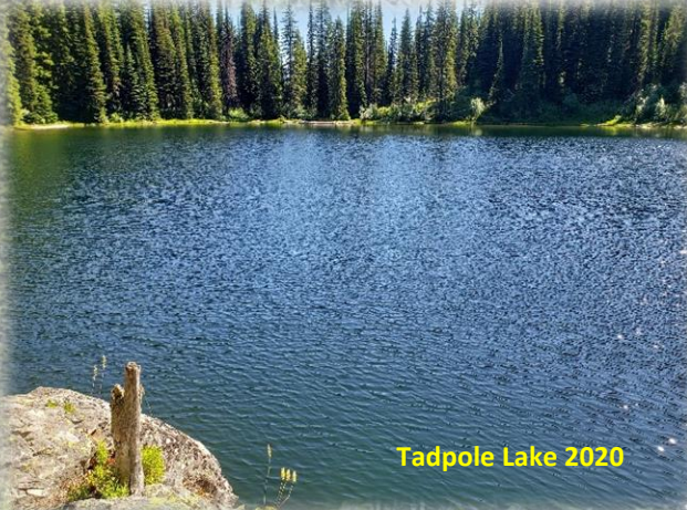
Tadpole Lake 2020

Follow the trail until you get into the trees and come to a flat area; hang a hard right off