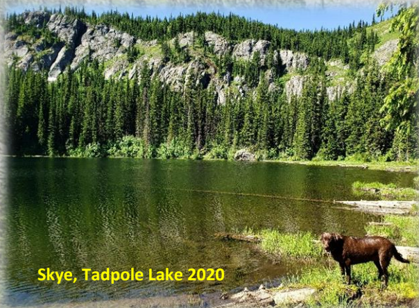
Skye, Tadpole Lake 2020

open hillside can be hot in the afternoon. There is no name for the lake on any Forest Service maps or Google Earth, but stocking reports have Tadpole Lake as the official name. When you leave just head back up the hill from the campsite along the north shoreline. Make sure you have bug spray as there are lots of mosquitoes.