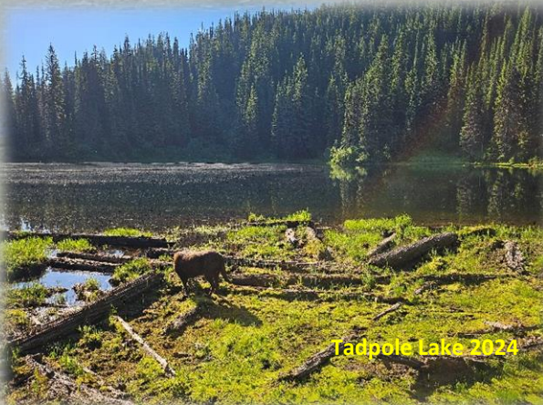
Tadpole Lake 2024