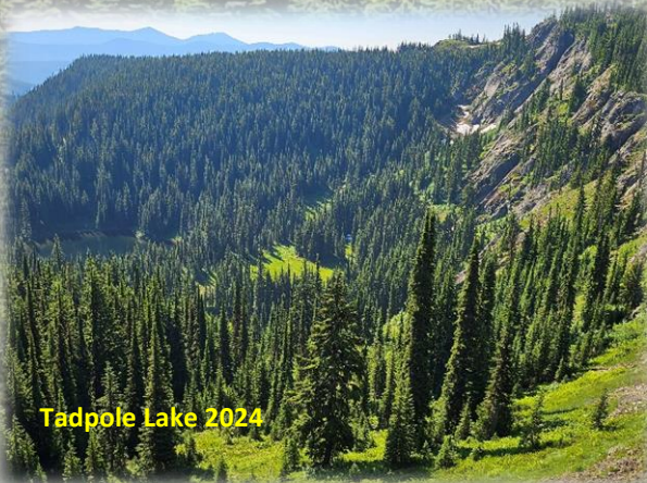
Tadpole Lake 2024