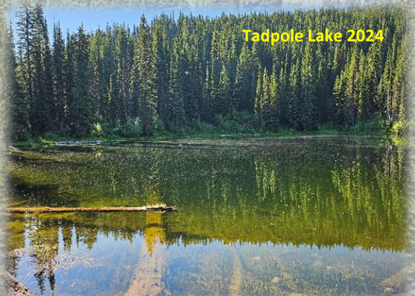
Tadpole Lake 2024