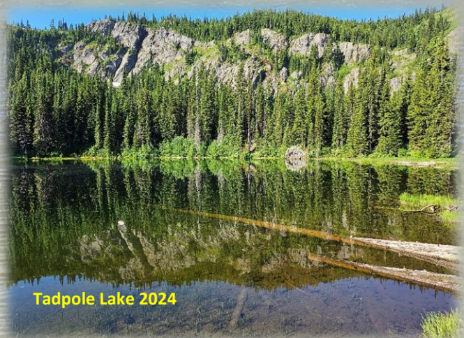
Tadpole Lake 2024

that angles up to the left; there is no signage. If you have a pickup and want to beat it up a bit more then go right ahead. Otherwise, there is a small wide spot to park at that point or park back at the junction of roads #305 and #391.