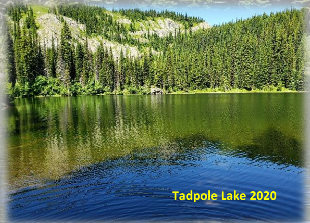
Tadpole Lake 2020