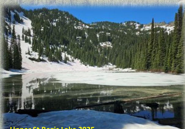
Upper St Regis Lake 2025

The trail (#267) starts at the parking area, there is also a small place to camp, and goes about a hundred yards where you angle down to the right and cross the creek coming out of the St. Regis basin. This early part of the trail is accessed by SxS and bikes until the creek crossing, then heads up toward the state line. Trail #267 crosses the creek then moderately climbs across the hillside for about a mile and crosses the creek again. The trail continues to climb moderately; there are 8 switchbacks to climb the final 450+ feet of elevation to the Lower St Regis Lake after the