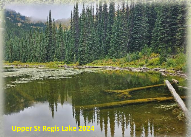
Upper St Regis Lake 2024

At the Lake: The upper lake is essentially a pond with no fish and lots of bugs. The lake is called the "Upper" lake but in all actuality is about 40 feet lower than the main lake, according to Google Earth. There are several campsites in the trees here, which appear to be mainly overflow from the other lake. This area around the lake seems to be quite full of mosquitoes.