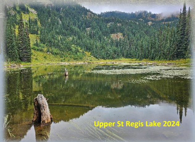
Upper St Regis Lake 2024

at gate at this junction to block access to the Eagle Peak expansion. Bear to the right after crossing the creek and continue for another half mile to the trailhead. The trailhead parking is very limited, just a couple vehicles if people park with some consideration. There are also places along the way to park and add a bit of distance to your hike.