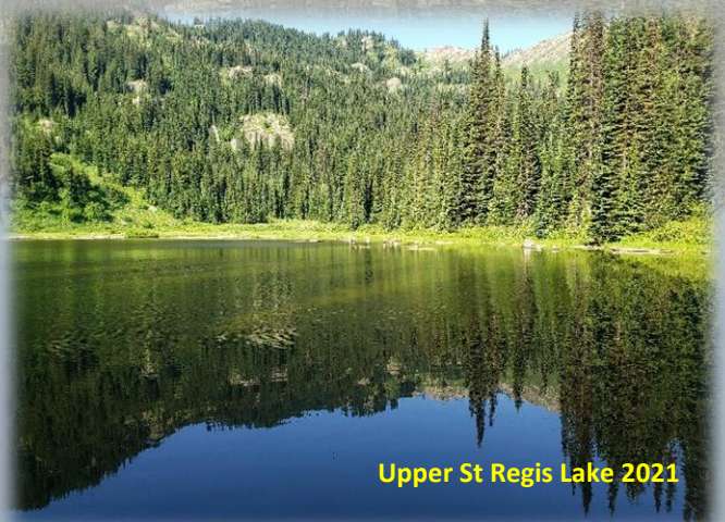
Upper St Regis Lake 2021