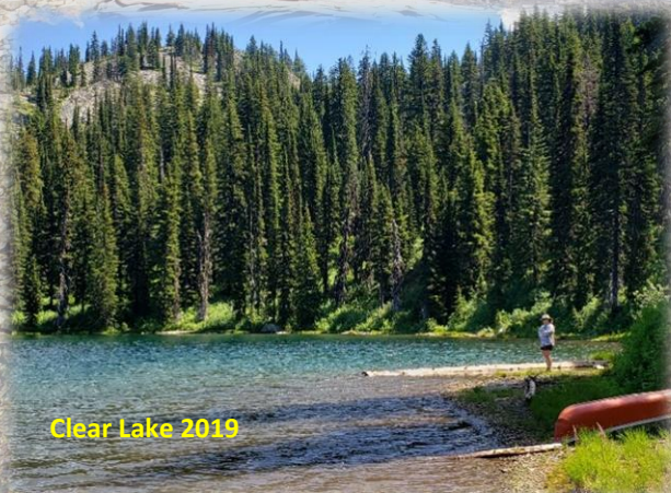
Clear Lake 2019

At the Lake: The last and only time I have been to this lake there was a canoe sitting along the shoreline. Quite a feat to get that down from the trailhead. There are several camping sites around the lake and the