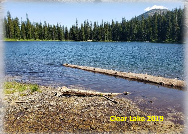
Clear Lake 2019

shoreline is easy to get around. The fishing was poor with little more than 6-inch trout available. The day my wife Kathy and I were there, a moose was hanging around the far shore for most of the time we were there. The lake is shallow near the shore, so it is easy to wade out for fly casting. The