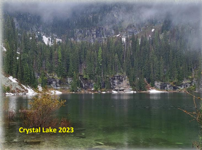
Crystal Lake 2023

The trail does cross the outlet and then continues up the hill. This will take you past the primitive trail to Rudie Lake and eventually ends on the state line road (#391) in a little over 2 miles. This is a nice day hike if camping for a couple days at Crystal Lake.