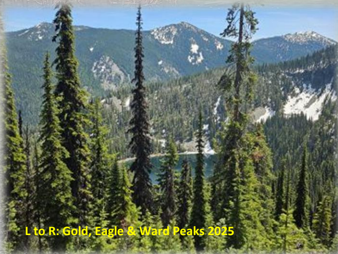
L to R: Gold, Eagle & Ward Peaks 2025