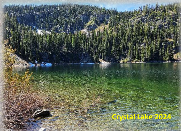
Crystal Lake 2024