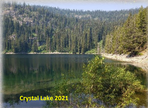
Crystal Lake 2021