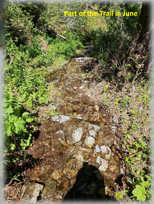
Part of the Trail in June