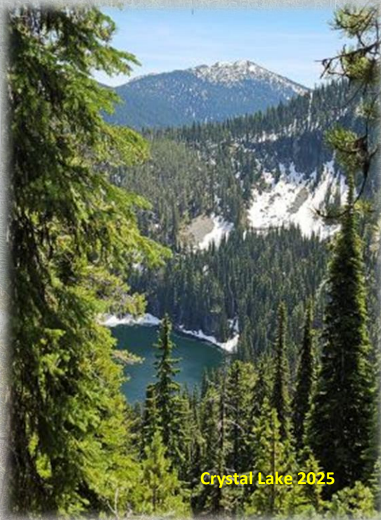
Crystal Lake 2025

At the Lake: There are several places to pitch a tent on either side of the outlet, but the right side is very minimal. There is also an outhouse to the left up in the trees. There are some small trout in the lake, but generally the fishing is poor. The shoreline is easy to get around and there is an old mine shaft on the far side of the lake. It is actually