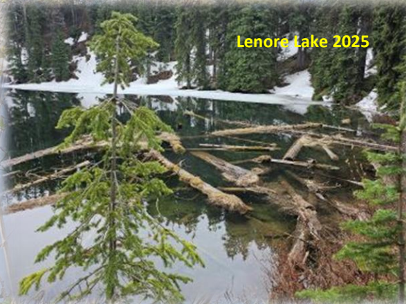
Lenore Lake 2025