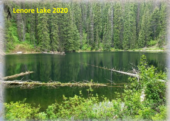
Lenore Lake 2020

through much of the deadfall to the first old logging road, but it is hard to find after that. The draw eventually will flatten out a bit. It is easy to drift to the left if you lose the trail and get out of line with the lake. Early in the year the outlet stream is visibly running, but during the summer months it doesn't stay on the surface.