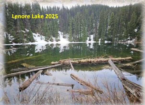
Lenore Lake 2025