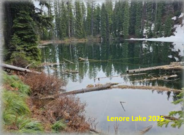
Lenore Lake 2025

With the amount of timber, brush, and the small lake profile it is hard to tell where the lake sits, you won't see it until you are virtually there. I did find that I had dependable cell service part way up the hill and while at the lake, so you can access maps and have a good idea where you are in relation to the lake. Stay to the right side of the creek, but not too far towards the ridge. You will cross 2 old logging roads, but they are totally brushed in and worthless to try to navigate. Be patient and pick your way through the deadfall (lots of it) and brush.