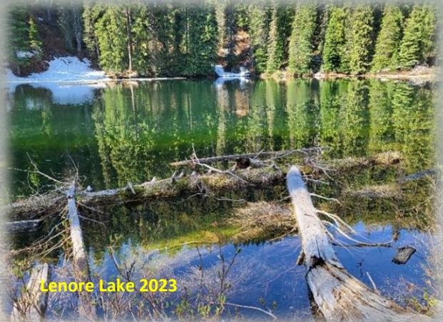
Lenore Lake 2023

When I went back in 2023 and 2025, I didn't see any fish (Cutthroat) like I did in 2020.