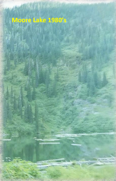
Moore Lake 1980's