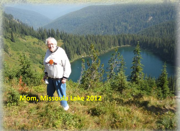
Mom, Missoula Lake 2012

minutes. People bring pontoon boats and kayaks in, and it does get significant fishing pressure. There are a couple of small campsites near the outlet but in general people don't camp there very often. There is no trail around the entire lake; you need to take the 3rd trailhead down to access the far side or do a lot of bushwacking around the lake to get there. I always find it interesting that many lakes that have lots of traffic do not have a trail around the lake, whereas a remote lake like Crater Lake has a trail around it.