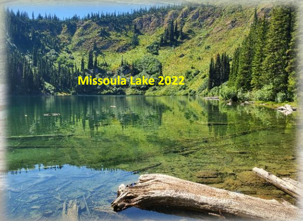
Missoula Lake 2022

The campground above the lake itself is nice, although no water is available. There are about 10 sites available and 1 vault toilet services the campground; that can get rank if users are slobs. About half the sites will accommodate up to a 24-foot trailer; we have