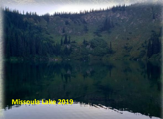
Missoula Lake 2019

minutes. People bring pontoon boats and kayaks in, and it does get significant fishing pressure. There are a couple of small campsites near the outlet but in general people don't camp there very often. There is no trail around the entire lake; you need to take the 3rd trailhead down to access the far side or do a lot of bushwacking around the lake to get there. I always find it interesting that many lakes that have lots of traffic do not have a trail around the lake, whereas a remote lake like Crater Lake has a trail around it.