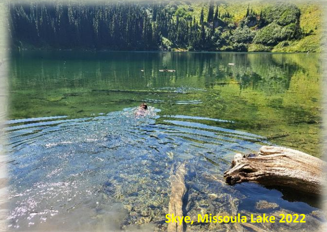
Steve, Missoula Lake 2022

first of 3 different trailheads, you can park there, and the lake is an easy 0.35-mile stroll down the hill. The second trailhead is at the far end of Forest Service Campground and there is signage. This trail connects into the first trailhead trail and continues to the lake coming in at the lake's outlet. The third trailhead is just to the left of the second. It takes off through the far-left campsite and goes straight down the hill and accesses the far side of the lake near the inlet. This is a steep climb in and out.