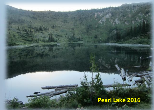
Pearl Lake 2016