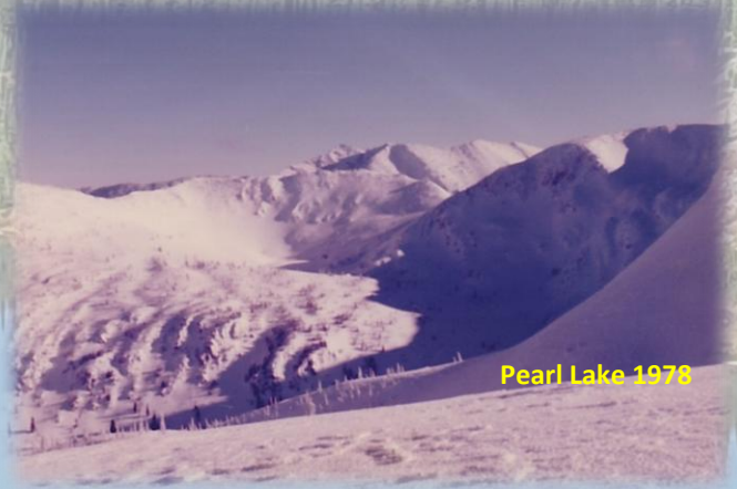
Pearl Lake 1978

gradually climbing up the valley for 2+ miles. Then the trail turns up the hill and climbs much steeper for the next 3/4 mile to Heart Lake. Cross the outlet onto trail #175 and continue around Heart Lake to the far end. The trail continues to climb and switchback up the hill for 1 mile to Pearl Lake for a total of 4.0 miles.