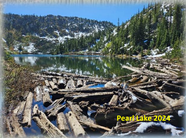
Pearl Lake 2024