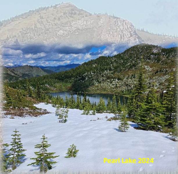
Pearl Lake 2024

snowshoes in the backcountry in our teens; what could go wrong. We had no clue about avalanche safety; there were places we went where I wouldn't go today even with the best equipment and knowledge. I spent a lot of time soloing along the state line. The farthest I skied was all the way to the high point past Dalton Lake that looks down into the Trio Lakes. I started in almost 10 feet of snow at Hoodoo Pass, but by the time I got above Pearl and Dalton Lakes there was bear grass sticking up out of the snow. The wind scoured the slope so much that there was