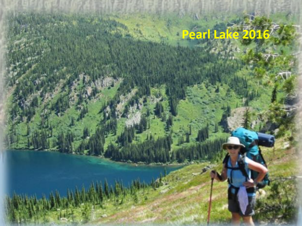
Pearl Lake 2016