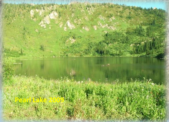
Pearl Lake 2009

Pearl Lake used to be one of the premier fishing lakes in the 70's and early 80's along the state line. It wasn't uncommon to catch 10 fish in just an hour if you hit it right. Usually, the fish were around 12 inches but 15+ inches were occasionally caught. In the 60's and 70's Fish & Game used to stock thousands of fish in these mountain lakes, but nowadays it is only a couple hundred every 5-7 years. Swimming is good in the lake and the prominent