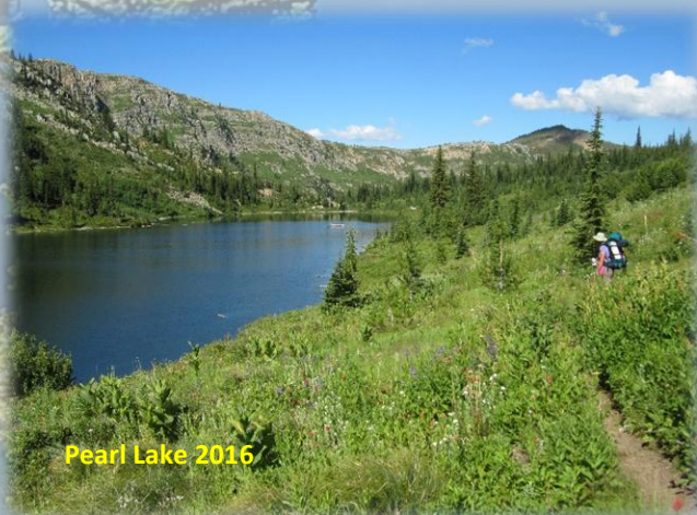
Pearl Lake 2016

Even though the distance on the Heart Lake option is shorter, I still prefer hiking along the state line. This is the route we used to ride our motorcycles and the views are spectacular. It only took us 20 minutes to ride from Hoodoo Pass to the drop into the saddle. I believe Rod Ebelt owned the record of less than 15 minutes to ride the single track back to Hoodoo. The 2 pictures looking into Pearl Lake in both the summer and winter from about the same location above Heart Lake are some of my favorites along the entire state line.