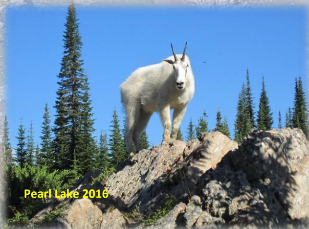
Pearl Lake 2016

submerged rocks are only a few feet underwater, so you stand on them. The goats that roam this area are not shy, the last time Kathy and I camped at Pearl we had 14 goat's hangout around camp for most of the day. They were a little bit of a nuisance looking for salt. In the 70's and 80's we only saw occasional goats along the state line. Now they are such a nuisance that there is a big sign at Heart Lake warning about them.