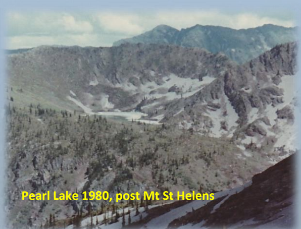
Pearl Lake 1980, post Mt St Helens