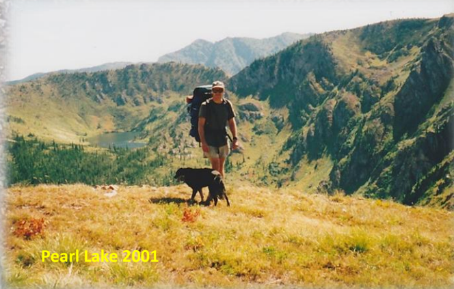
Pearl Lake 2001

Getting There: At Superior, take Diamond Road east past the Town Pump Gas Station for 6 miles; passing the Bark mill and the Magone Ranches to the end of the pavement where the road changes to Trout Creek Road (#250). Continue up Trout Creek Road (~14 miles) to the Heart Lake Trailhead. There is a vault toilet and parking for over 20 vehicles. Trail #171 takes off on the far side of the parking area. The trail wanders through the bottoms,