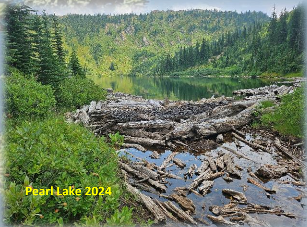
Pearl Lake 2024