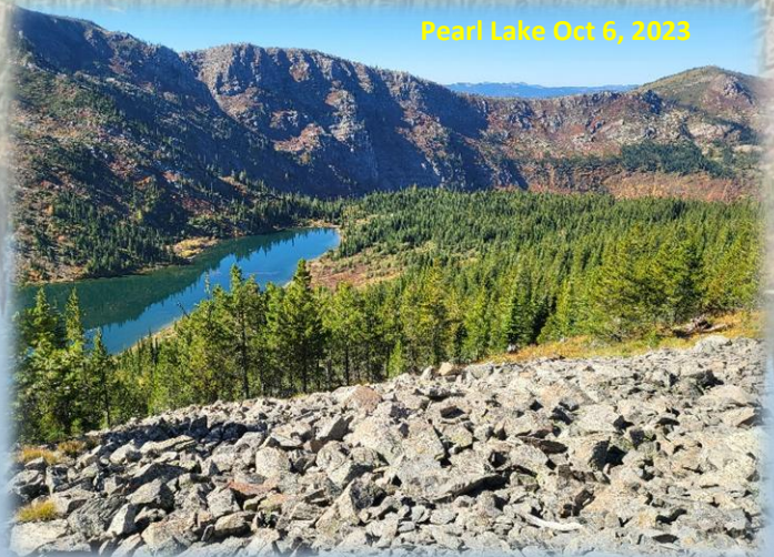
Pearl Lake Oct 6, 2023

I have been hiking and camping along the state line for more than 50 years, but I find there are times that still defy proper description for its beauty. The weekend of October 6 & 7, 2023, was one of those times. Usually, by this date the state line already has some snow and winter is well on its way. The year of 2023 though provided one of the grandest October weekends that I can ever remember. On the 6th I did a day hike into Heart, Pearl and Dalton Lakes and a side trip to the top of Fletcher Gulch. On the 7th, I hiked into Hidden Lake.