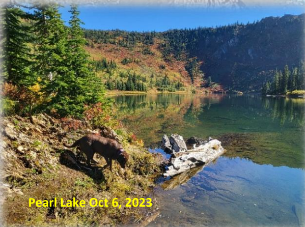
Pearl Lake Oct 6, 2023