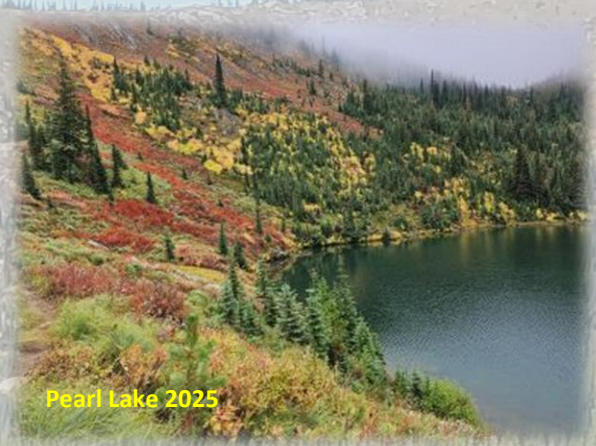
Pearl Lake 2025