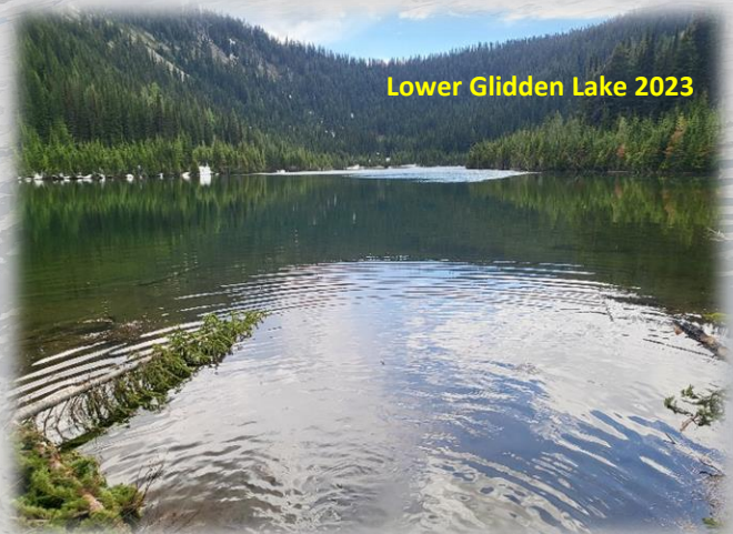
Lower Glidden Lake 2023