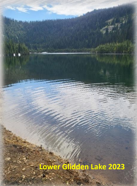
Lower Glidden Lake 2023

At the Lake: This is a drivable lake that has good access for over halfway around the lake with numerous campsites. I do not know if there are any vault toilets, but from what I recall all the campsites are primitive. It seems to be a bit swampy in places and I would bring a boat or float of some kind. Electric motors are only allowed I do believe. I am not sure how the fishing is, but it does get stocked multiple times during the year and there is a significant amount of fishing pressure.