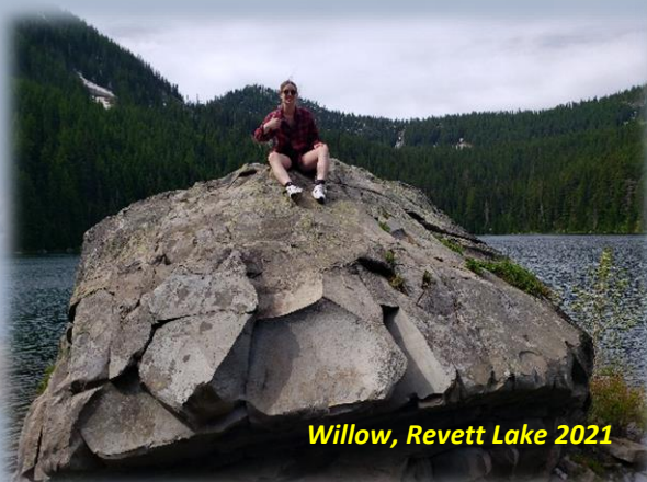
Willow, Revett Lake 2021

At the Lake: There are several campsites on both sides of the outlet and a couple others close to the inlet stream on the far end of the lake. There is a nice little beach on the far side of the lake with a fire pit along the lake. Compared to the trail to the lake the lakeshore trail is quite rough, steep and has a few deadfalls across the trail. I first went into this lake on my birthday weekend (a