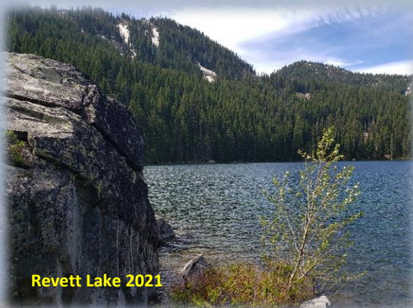
Revett Lake 2021

In 2023, my son (Colter) and I completed the Thompson Pass Loop and came into the lake at the outlet. The campsites at the inlet were full but there were still a couple sites near the outlet available.