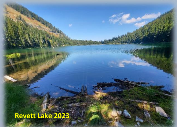
Revett Lake 2023