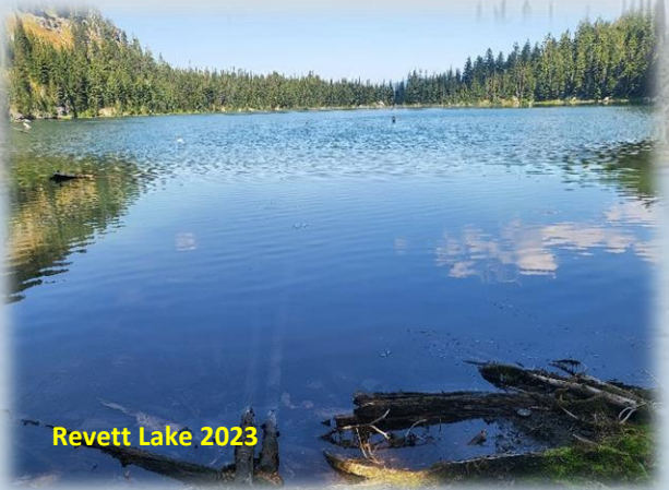
Revett Lake 2023

lake. The trailhead was completely full, with vehicles parking several hundred yards back down the road, with more groups arriving. I wouldn't be surprised that 100 people visited Revett Lake that day. This is definitely a lake to visit during the week to avoid the crowds.